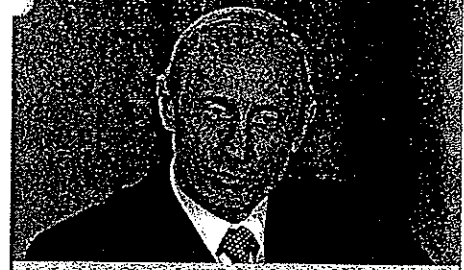
Vladimir Putin 1952–

Vladimir Putin worked for 15 years as an intelligence officer in the KGB (Committee for State Security). Six of those years were spent in East Germany. In 1990, at the age of 38, he retired from the KGB with the rank of lieutenant colonel.